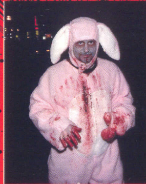
Some bunnies believe in God, most believe in zombies

A conspiracy was taking place. The children were told they would be rewarded by fantastical creatures with toys or chocolate for behaving appropriately and according to the cult's rules. Of course this procedure of rewarding appropriate behaviour is called operant conditioning. These people don't know exactly why they do this and will probably never even have considered it till you ask them. What's more, they can't stop themselves and will pay hundreds just to buy the toys or chocolate evidence to furnish delu-