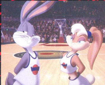
White Rabbits can't jump

Before I explain to you how the cult have completely brainwashed me and so many others, let me explain what I mean by brainwash. The victims are conditioned, or trained to believe a certain thing or behave in a certain way. Some techniques include Pavlovian conditioning and operant conditioning, either of which may be used by any particular cult. The earliest studies of Pavlovian conditioning involved making dogs salivate to a bell - expecting food that was not going to be brought to them. In operant conditioning the victim is rewarded or punished for their behaviour, in order to shape their behaviour into one desired by the cult. Over time these forms of conditioning form positive associations or expectations of an individual from being part of a cult.